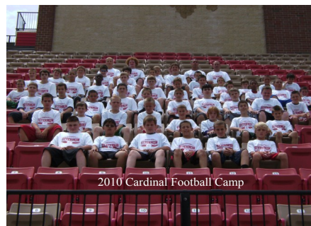
2010 Cardinal Camp

DAY CAMP 2011 CARDINAL YOUTH FOOTBALL CAMP APPLICATION DAY CAMP ~ 1 South Grove St., Athletics Department, Westerville, Ohio 43081 ~ Checks made payable to: Cardinal Football Camp